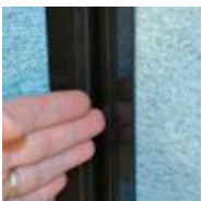
No pinch seams