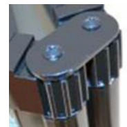
360 degree panel hinges