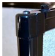
Lightweight aluminum frame